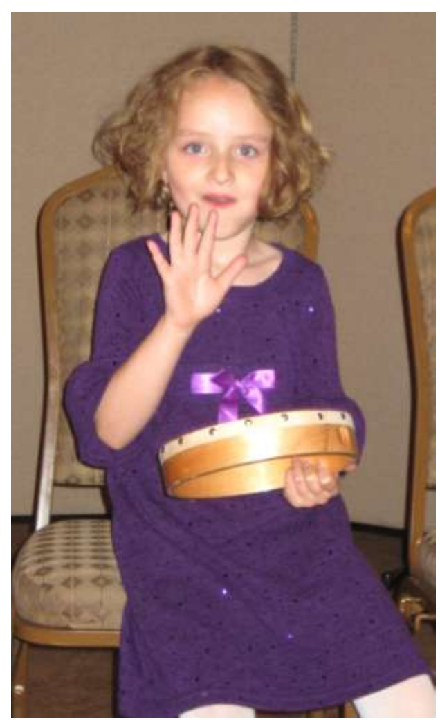
I can play a tambourine, play a drum, or use a shaker if I want.