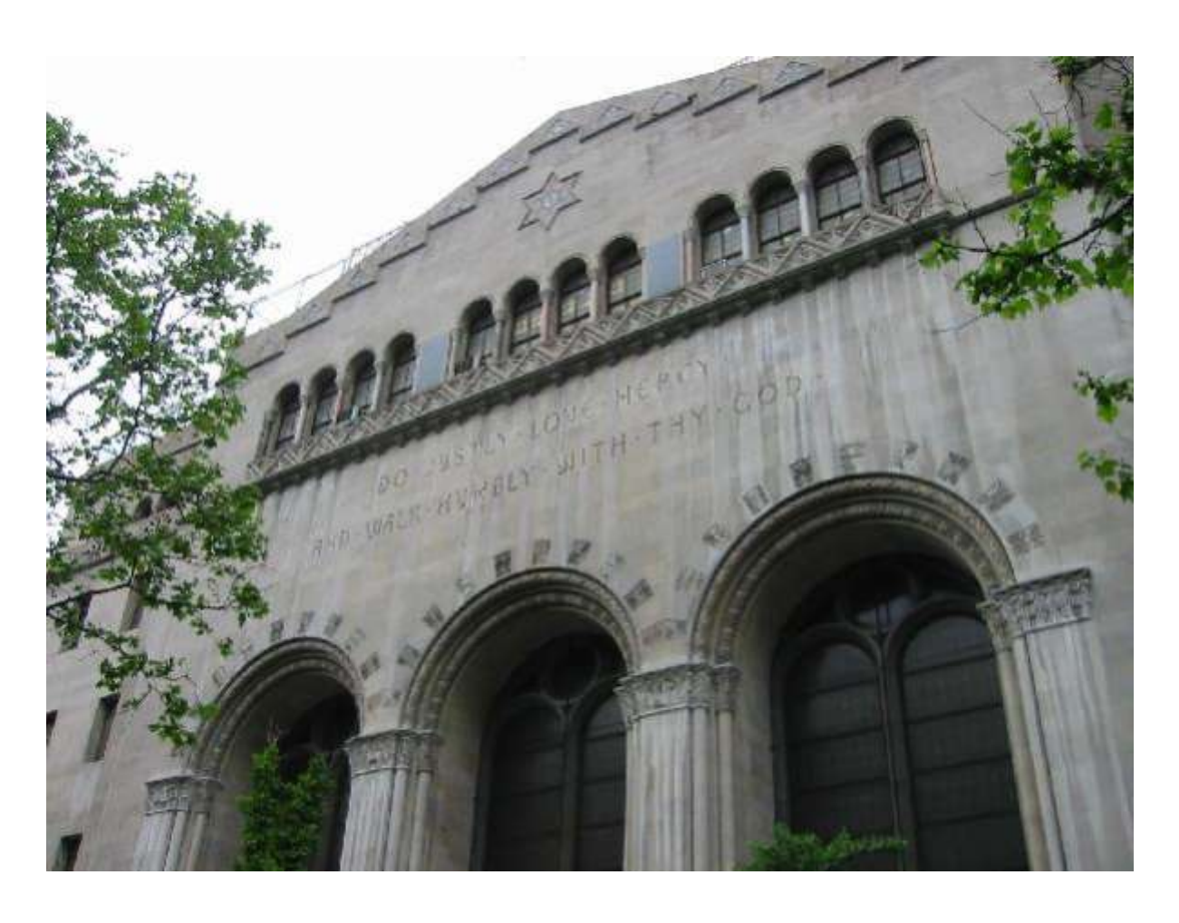
I am going to a Chanukah service at Rodeph Sholom on Saturday!