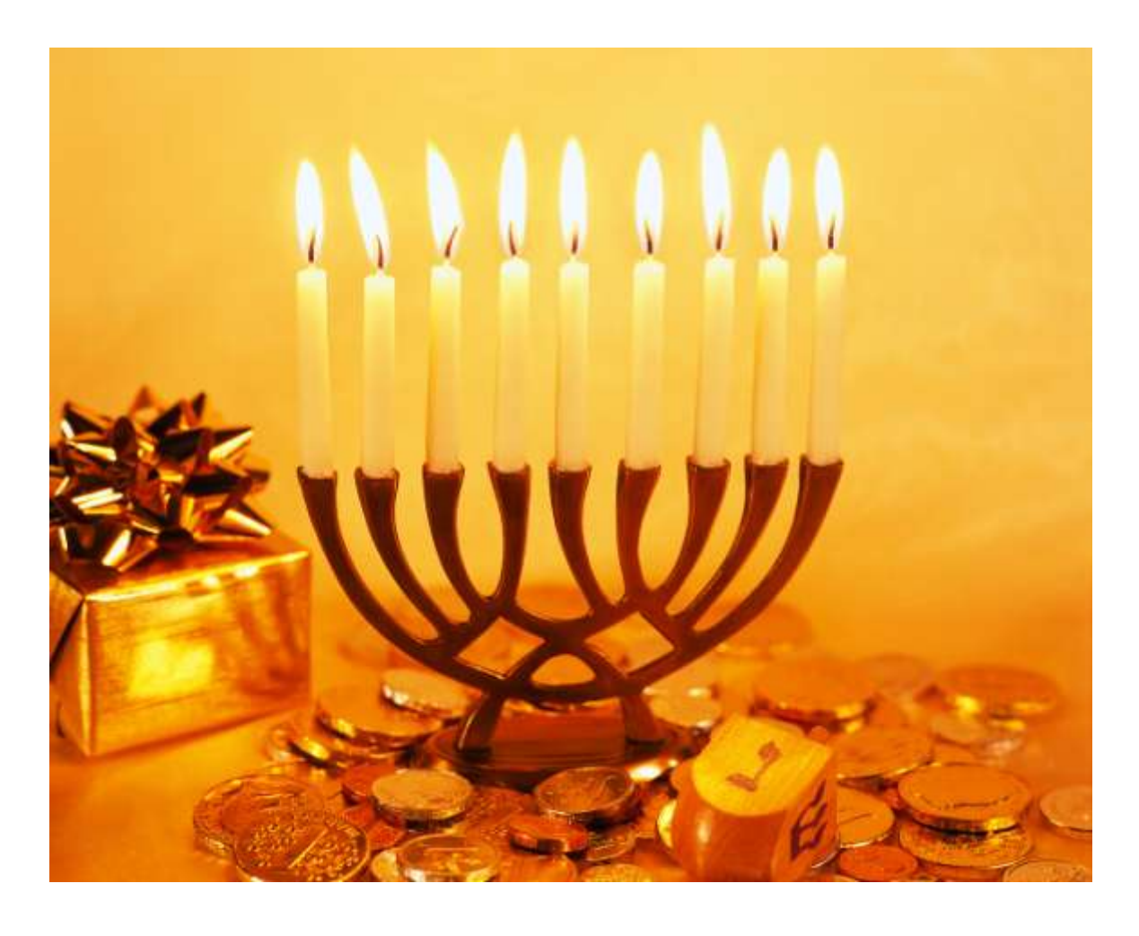
Rabbi Ben will light the chanukiyah. The chanukiyah is a special candleholder for Chanukah.